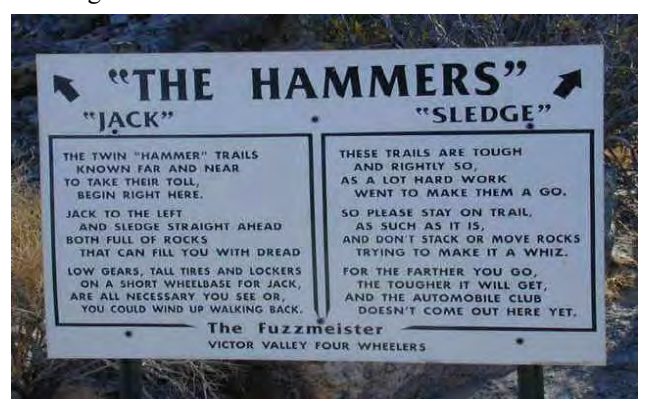
Four wheeler guide to the hammers article with detailed descriptions for each trail: