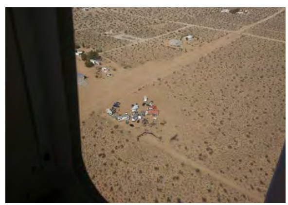
aerial view of the camp ground.

Campsite/ Run meeting location: Campsite @ Valley Vista Airport (Landers). Daily runs will stage here at 9AM and depart @ 9:30 AM. (DO NOT DRIVE ON ANY AIRPORT PROPERTY AT ANY TIME) more info below.